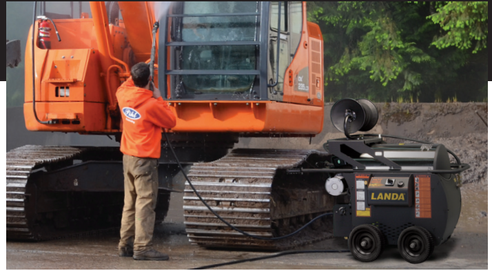
Model HOT4-20024 pictured